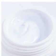
BUILDER GEL WHITE