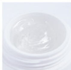
BUILDER GEL CLEAR