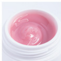
BUILDER GEL COVER NATURAL