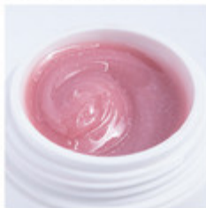
BUILDER GEL BB SILVER