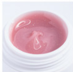
BUILDER GEL BB GOLD