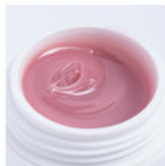
BUILDER GEL COVER WARM