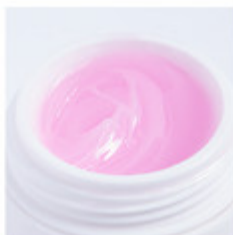
BUILDER GEL COVER PINK